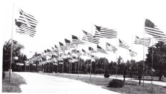
This "Avenue of Flags" photo was taken at Resthaven Memory Gardens cemetery near Moulton, Ohio on a Memorial Day in the late 1970s.

Memorial donations are welcomed in any amount. When donations for any one person or couple have reached $100.00, a brass plate engraved with their name(s) is attached to the Memorial Plaque.